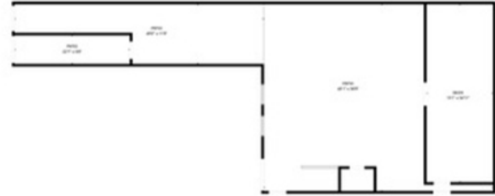
OUTDOOR REAR PATIO